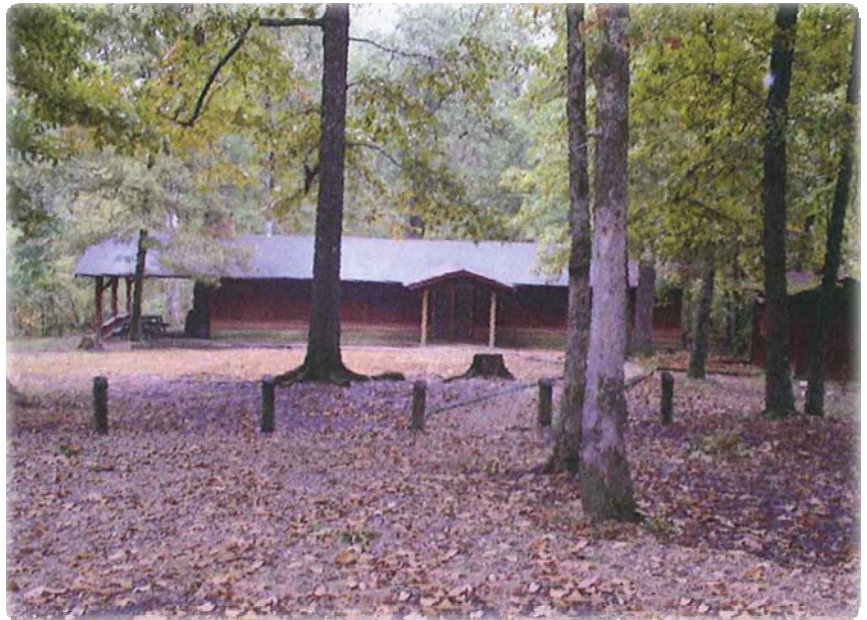
Camp Fisherville Lodge

The lodge has a large room with a fireplace and an overhead heater. The kitchen is equipped with a refrigerator and a stove. There is space for 30 people to sleep on the concrete floor with mattresses that are provided.